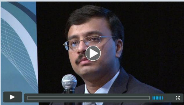
Should Genetic Testing Be Routine in CLL Patients?