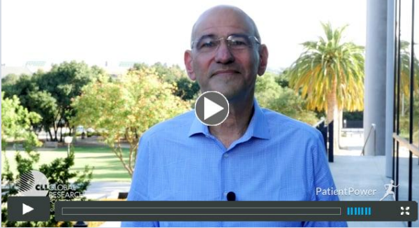
iwCLL 2015 Research Highlights