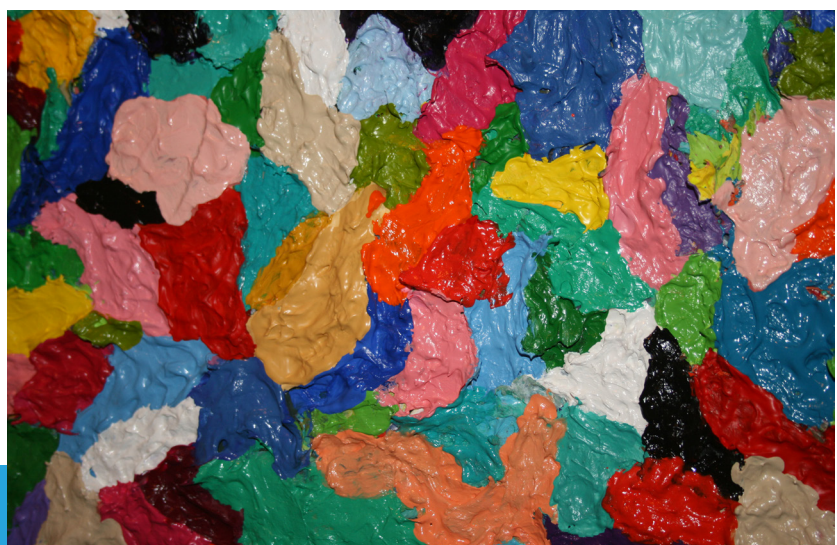
Night of Art and Wine featuring art by LeeAnne Domangue

It is thanks to the generous support of all our donors that CLL Global is able to fund cutting edge research, help train the next generation of researchers and clinicians, and reach out to the public through onsite and online education forums. This spring we were fortunate to benefit